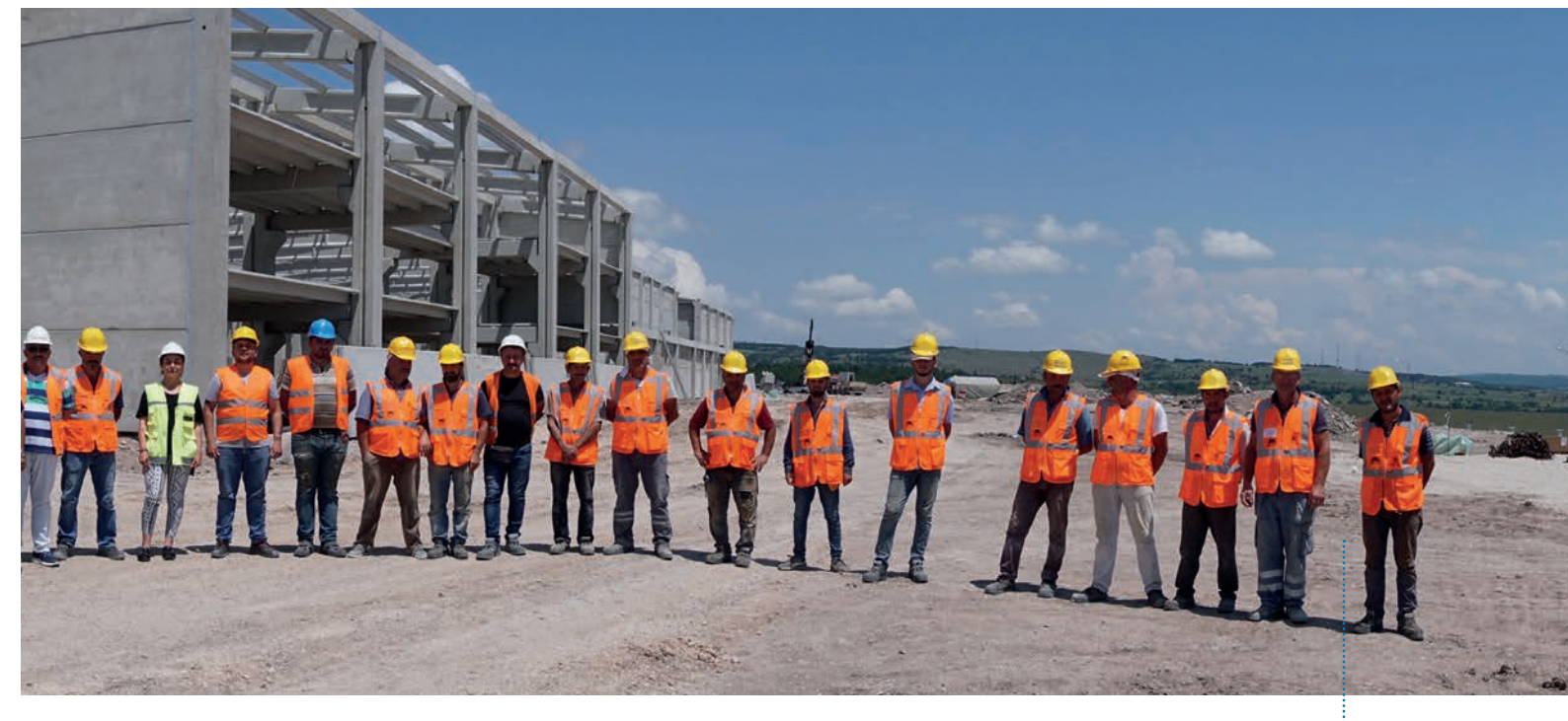
The local civil construction team